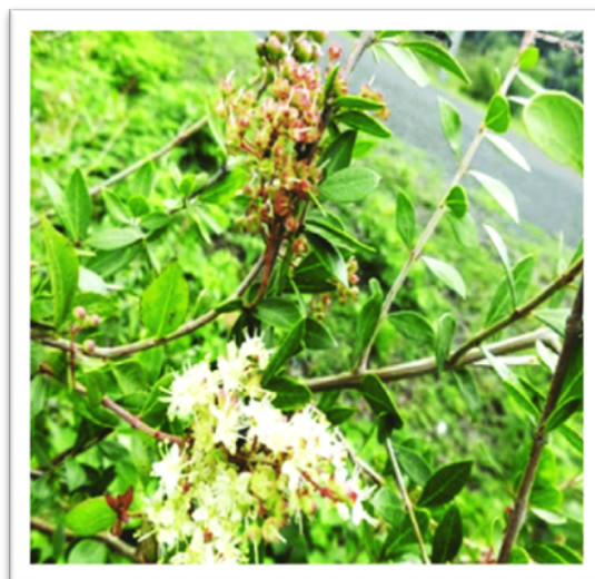
Figure 9: Lawsonia inermis L.