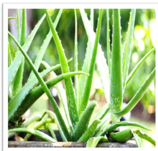
Figure 1: Aloe vera L.

taneously promote the growth of hair. Thus, hair loss problem can be countered by applying the gel on the scalp (Basmatker et al. , 2011).