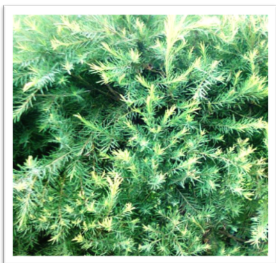
Figure 5: Melaleuca alternifolia