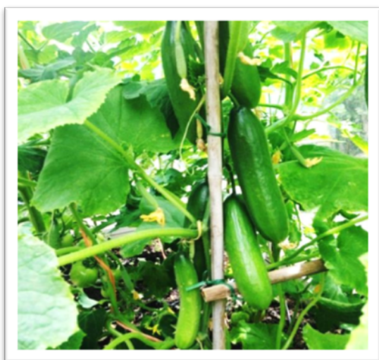
Figure 4: Cucumis sativus L.