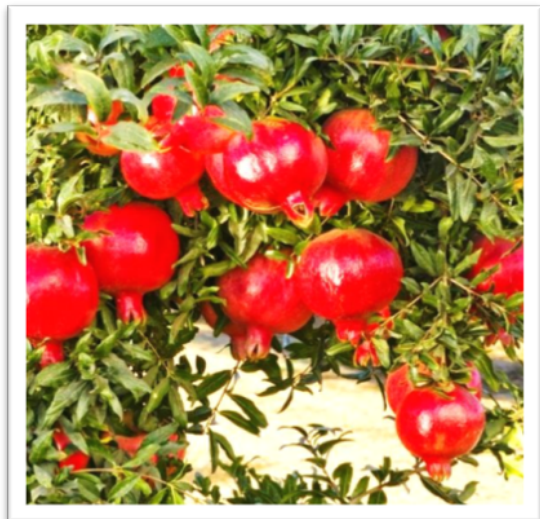
Figure 6: Punica granatum