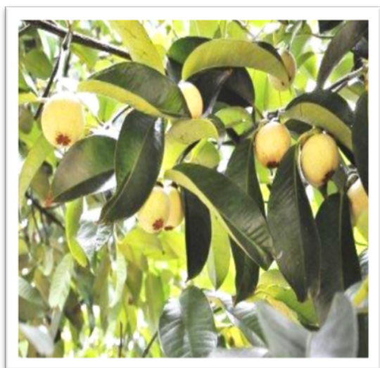
Figure 7: Garcinia mangostana