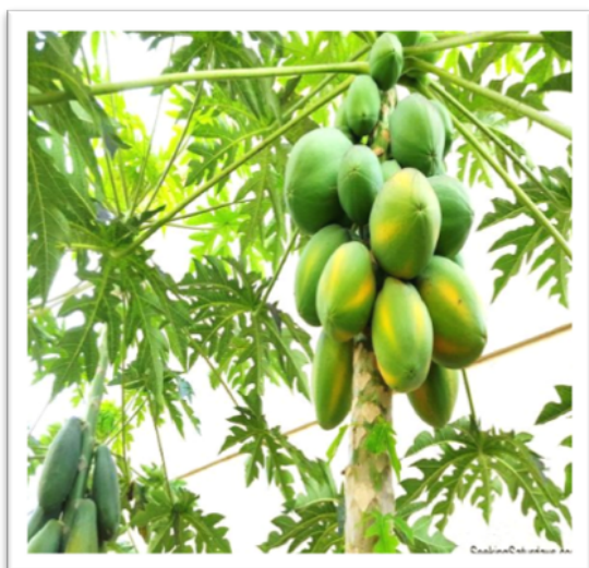
Figure 8: Carica papaya L.

up to 10 meters. This woody plant has trunks that are covered in a greyish or brownish cracked bark. Its young leaves are in red and eventually turn to green when it is matured. It has a narrow and lance-shaped, glossy and leathery type of leaves.