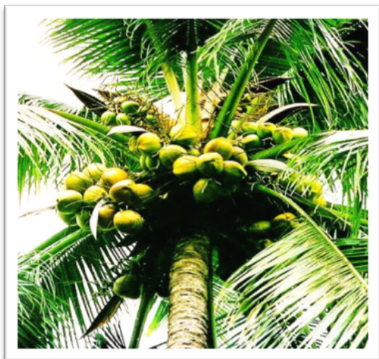
Figure 3: Cocos nucifera L.