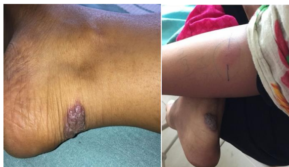
Figure 1: Well-defined hyper-pigmented indurated verrucous plaque over the posterior aspect of the right ankle.

Based on the history, clinical picture and clinic-pathology reports, diagnosis of tuberculosis verrucosa cutis were made.