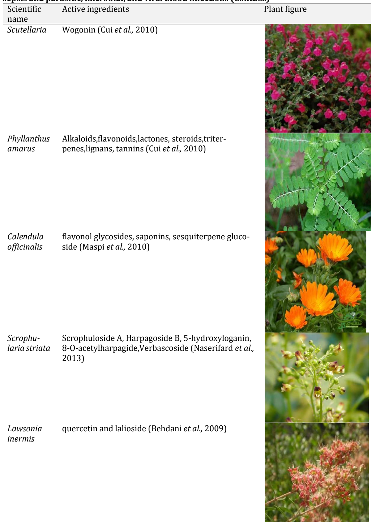
Table 3: The most important medicinal plants effective in the treatment and prevention of sepsis and parasitic, microbial, and viral blood infections (Contd....)

extract inhibits the secretion of HBsAg and HBeAg at 100 µg/mL and HBsAg at 120 mg/kg and is, therefore, effective to treat chronic viral hepatitis and septicemia (Cui et al. , 2010).