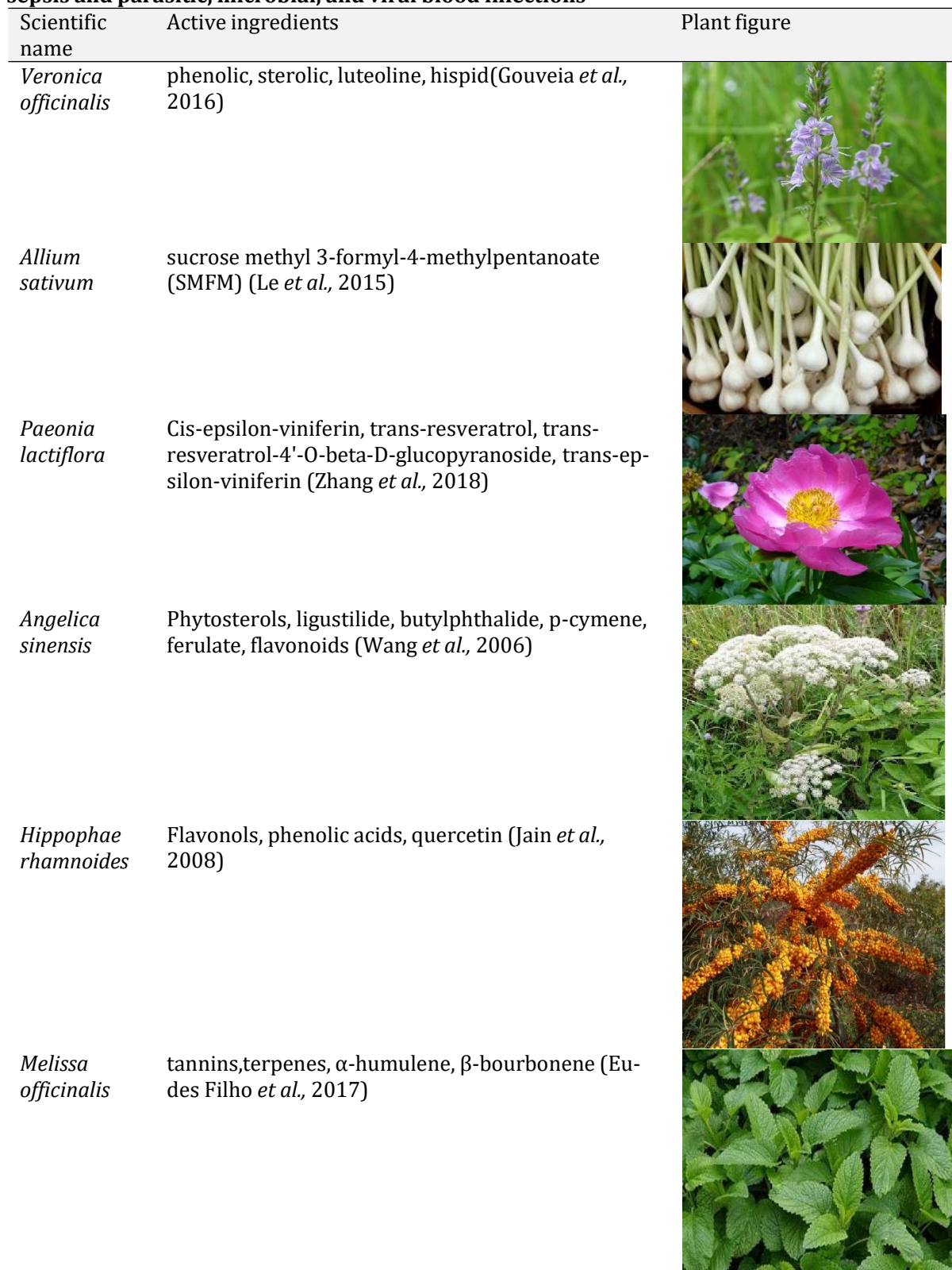
Table 1374: The most important medicinal plants effective in the treatment and sepsis and parasitic, microbial, and viral blood infections