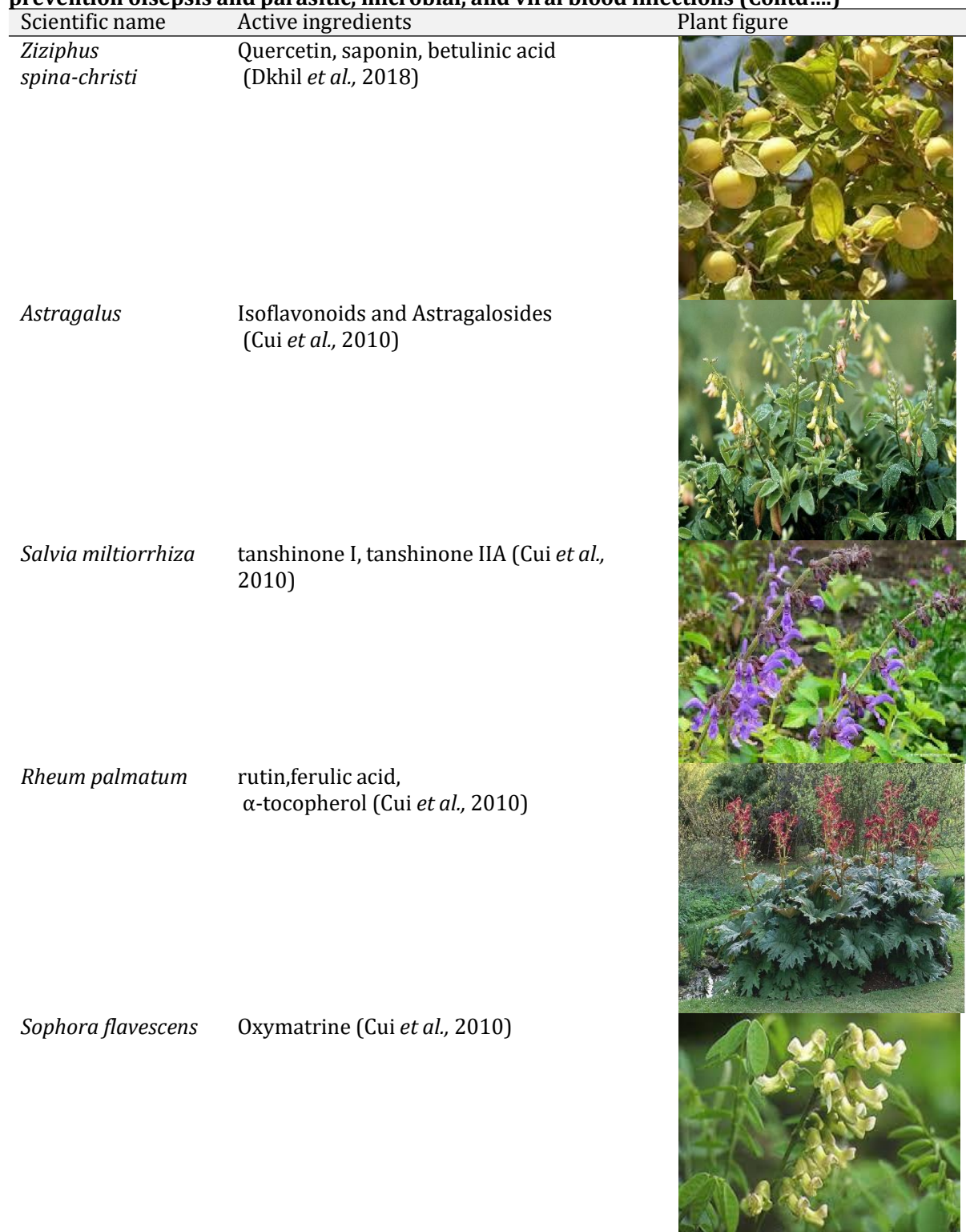
Table 1375: The most important medicinal plants effective in the treatment and prevention of sepsis and parasitic, microbial, and viral blood infections (Contd....)

the potent anti-inflammatory and hepatoprotective effects. Some of its compounds are involved in the NF- \kappa B and MAPK pathways. It also inhibits TNF \alpha and IL-1 \beta in the liver and spleen by inhibiting translocation of NF- \kappa B from the cytoplasm into the nucleus (Dkhil et al. , 2018).