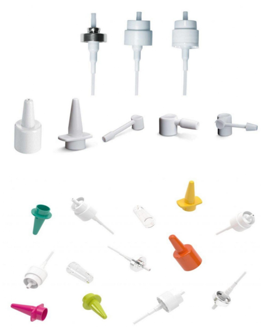
Figure 3: Different types of actuator and dip tube