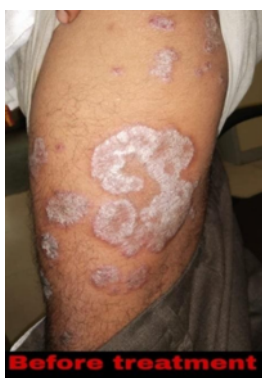
Figure 1: Silvery scaly lesion over left lower limb