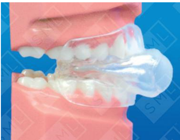
Figure 3: Tongue retaining device.

tic therapy, but with some hindrances with respect to OSA diagnosis (Behrents et al., 2019). CBCT does not give many details on neuromuscular tone, vul-