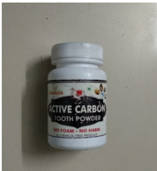
Figure 1: Goshala™ active carbon tooth powder

Aggregatibacter actinomycetemcomitans is susceptible to Amoxicillin at 0.8mg/ml, Metronidazole at 0.8mg/ml, Chlorhexidine at 1.6mg/ml and Goshala™ active carbon toothpowder at 0.8mg/ml. S = Sensitive and R = Resistant