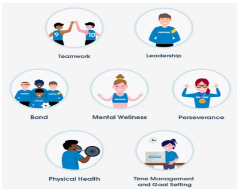
Figure 1: Benefits of playing sports

for the wounds that occurred because of baseball. This baseball further has more significant factors also in young people from age 5-14 of their age, through 3 to 4 kids moving with the wounds of baseball in each year.