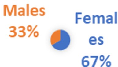
Graph 1: Description of sample

Primary outcomes for assessment of scapular position are Keibler’s method of scapular protraction assessment at three different positions of glenohumeral abduction that is at rest, at 45 degrees abduction and at 90 degrees abduction.