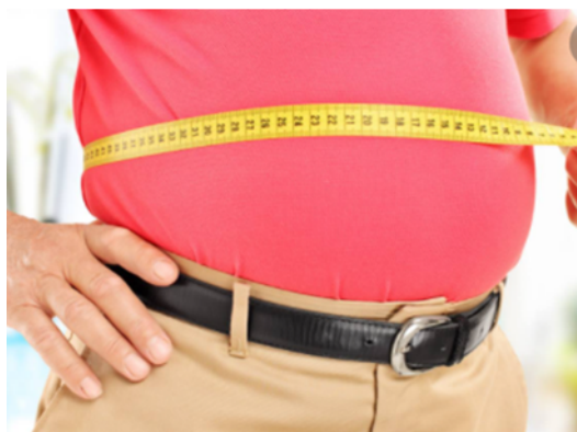
Figure 1: Overweight Obesity associated with increased rates of chronic disease

Their effect on their lifestyle obesity are mostly found in pubertal age groups of 13 to 15 because this pubertal age increased adipose tissue all over the body. (Chowdhury et al., 2016) Childhood obesity is augmented actuality by altering their family lifestyle. (Chowdhury et al., 2015; Ogden et al., 2009) Its cause an increased amount of purchase powder, growing hours of dormancy due to television, video game, and computer, and other social activities. (Bergman, 2012) WHO has designated the Obesity is one of nowadays, s most effective in public health problems.